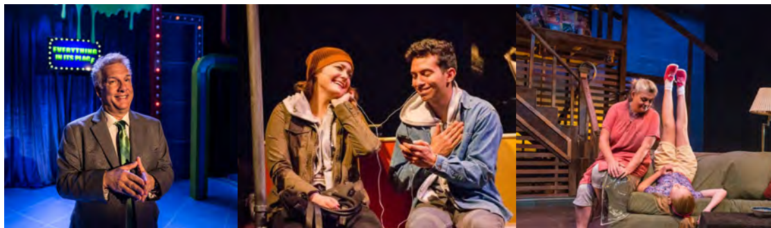
Photos from ATF's 2016 productions of Everything In Its Place, Island Song, and Home

PLEASE PROVIDE YOUR COMPANY'S INFORMATION ON THE REVERSE SIDE.